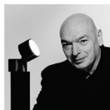
» Jean Nouvel